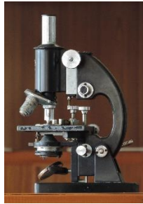
Example of acquisition method